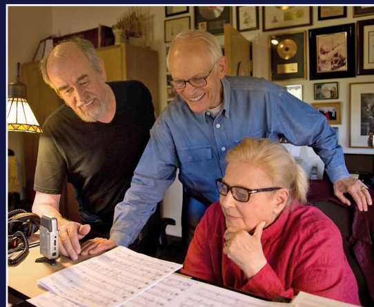
From left to right: Roger Kellaway, Alan and Marilyn Bergman writing a song for Visions of America.