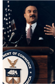
RON BROWN 30 TH US SECRETARY OF COMMERCE

"As I remarked to you then, I really enjoyed your speech – maybe you should spend some more time on the other side of the lens!